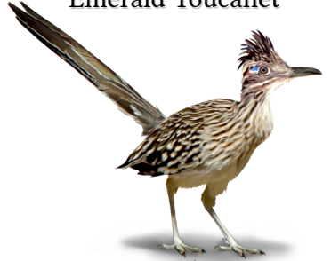
Geococcyx velox Alma de perro, Colosuca Lesser Roadrunner