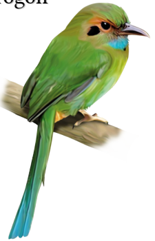
Aspata gularis Taragón cuello azul Blue-throated Motmot