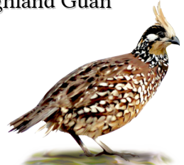
Colinus cristatus Codorniz copetona Crested Bobwhite