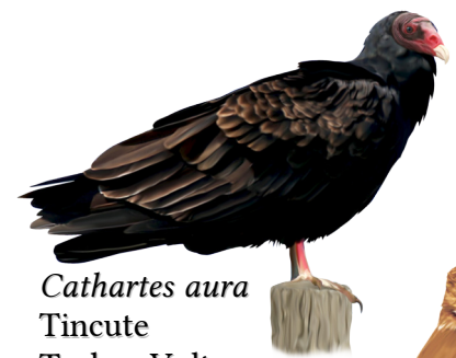
Cathartes aura Tincute Turkey Vulture