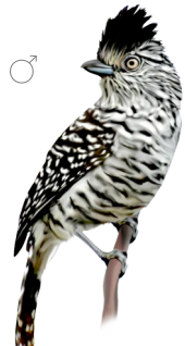
Thamnophilus doliatus Hormiguero común Barred Antshrike