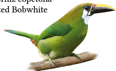
Aulacorhynchus prasinus Tucanillo verde Emerald Toucanet