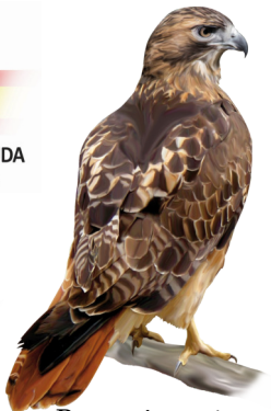
Buteo jamaicensis Gavilán cola roja Red-tailed Hawk