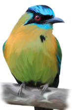
Momotus momota Taragón corona azul Blue-crowned Motmot