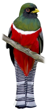
Trogon collaris Coa collareja Collared Trogon