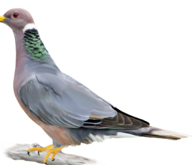
Patagioenas fasciata Paloma collareja Band-tailed Pigeon