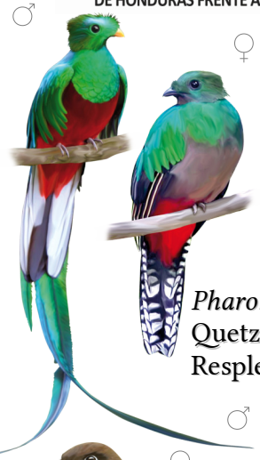
Pharomachrus mocinno Quetzal Resplendent Quetzal