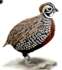
Cyrtonyx ocellatus Codorniz pintada Ocellated Quail