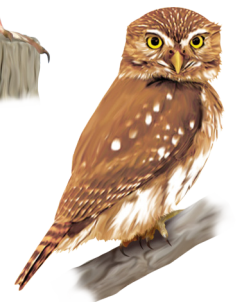
Glaucidium brasilianum Picapiedras común Ferruginous Pygmy-Owl