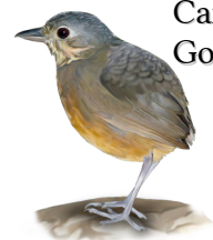
Grallaria guatemalensis Gallito montés empedrado Scaled Antpitta