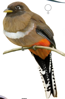
Trogon mexicanus Coa de ocotal Mountain Trogon